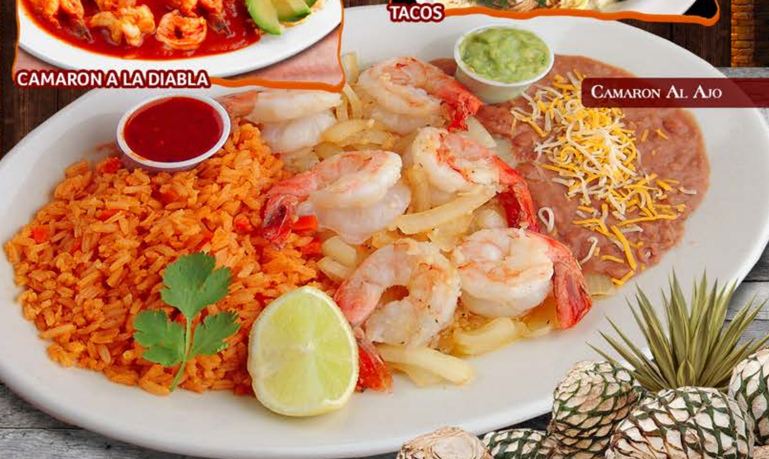
CAMARON AL AJO