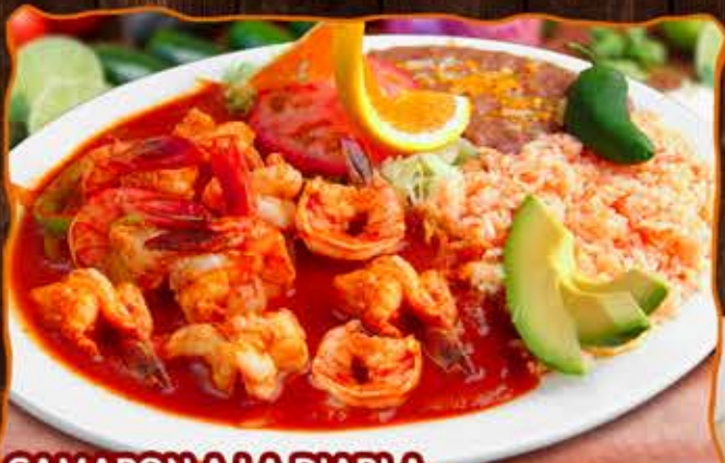
CAMARON A LA DIABLA