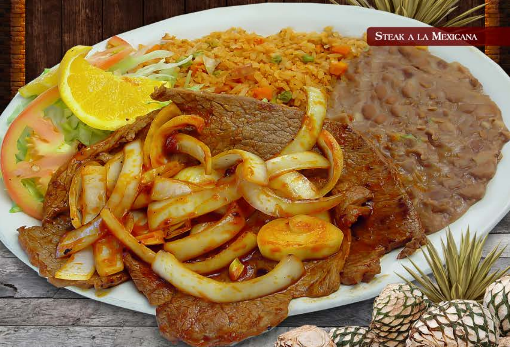
STEAK A LA MEXICANA

CARNE ASADA . . . . . 12.99 Steak on top of bed of grilled jalapeños and onions. Served with Mexican rice, refried beans and salad.