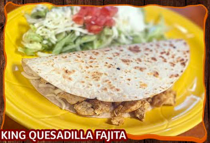
KING QUESADILLA FAJITA