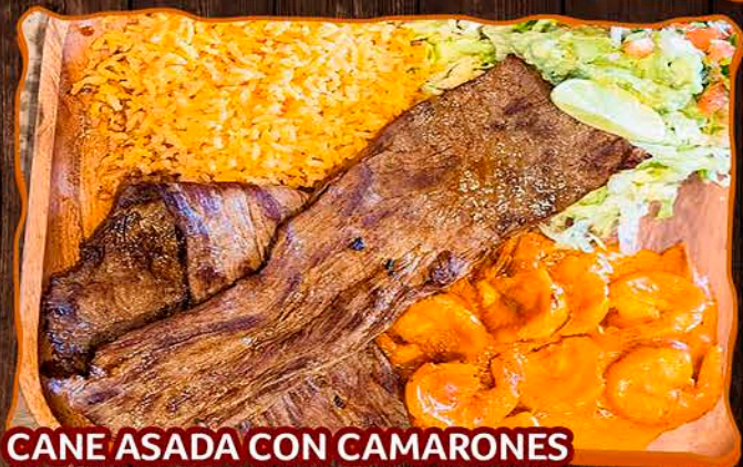
CARNE ASADA CON CAMARONES