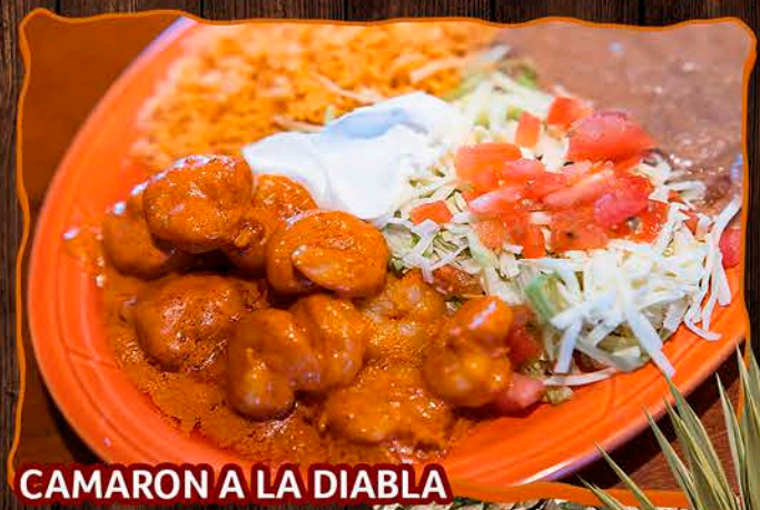
CAMARON A LA DIABLA