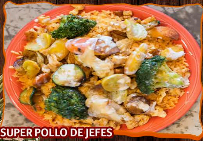
SUPER POLLO DE JEFES