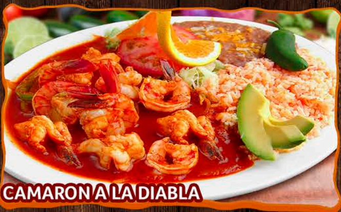
CAMARON A LA DIABLA