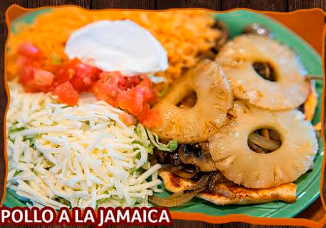
POLLO A LA JAMAICA